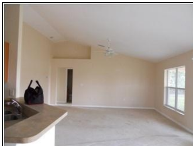
3.0 Picture 1