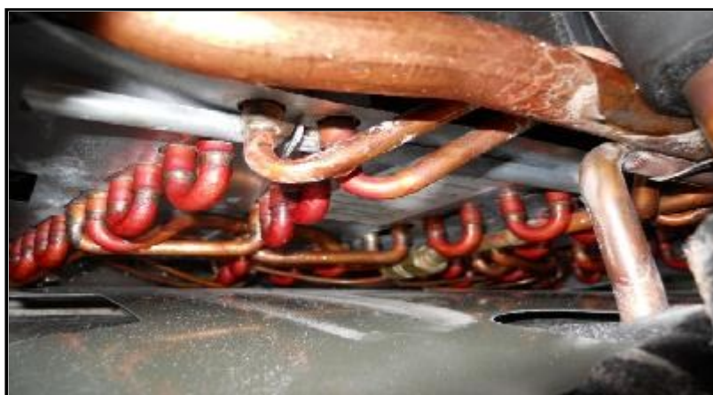
3.3 Picture 1