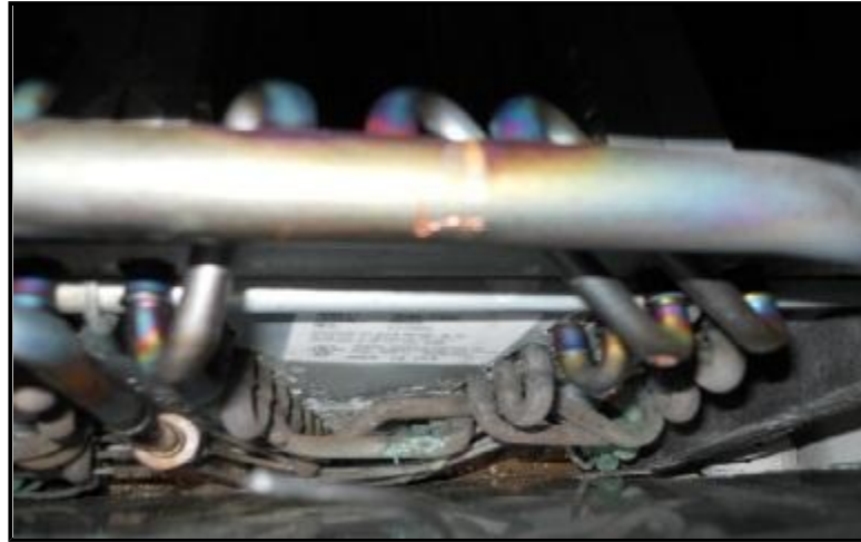
1.2 Picture 2