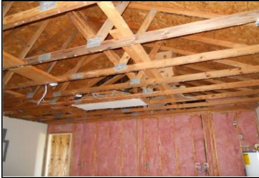
2.0 Picture 1