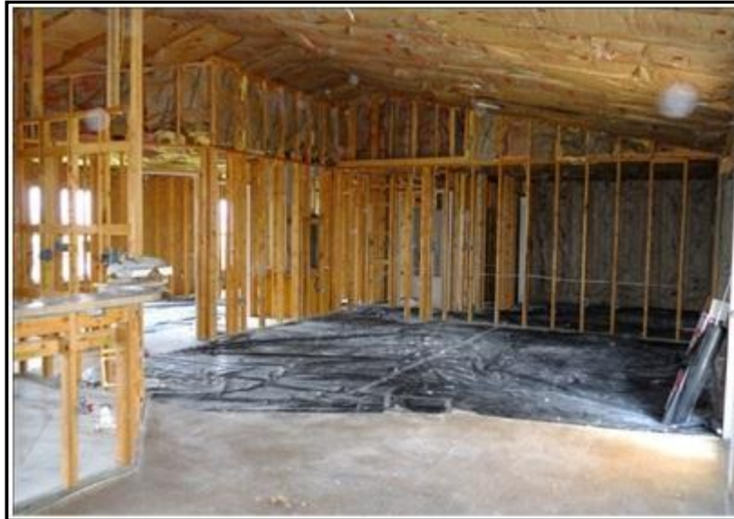
2.0 Picture 2