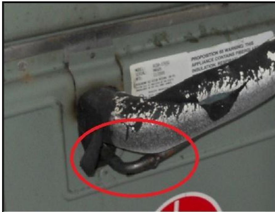
1.2 Picture 1