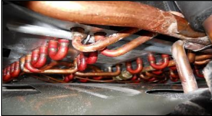
2.4 Picture 1