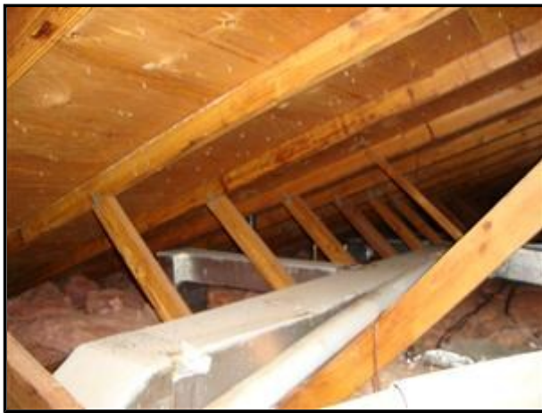
A. Picture 1

Roof system is water tight at this time.