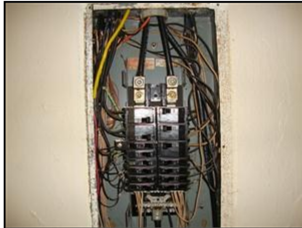
A. Picture 1

Electrical system is in good working condition at this time.