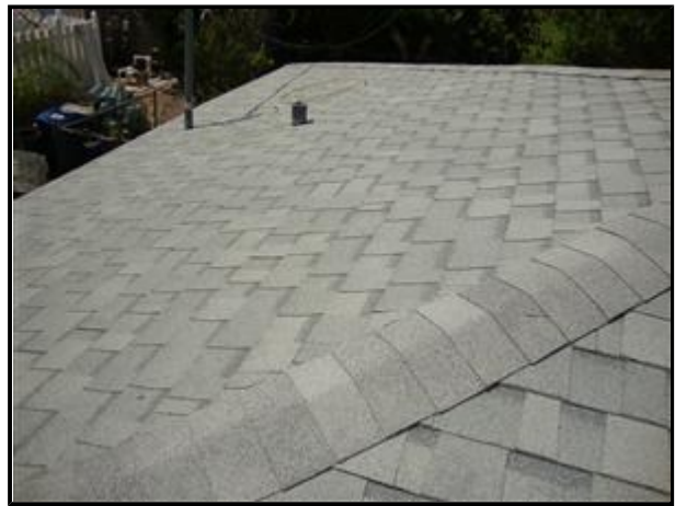
A. Picture 2