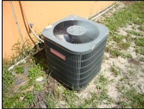
A. Picture 1

The cooling systems are in good working condition.