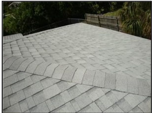
A. Picture 4