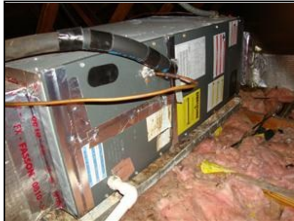
B. Picture 1

The heating systems are in good working condition.