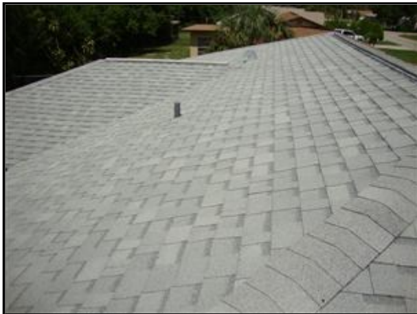
A. Picture 3